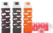
GLASS BOTTLE WITH SILICONE SLEEVE