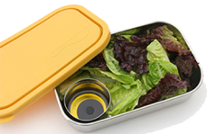
STAINLESS STEEL RECTANGLE CONTAINER

U KONSERVE produces durable and long-lasting lunch-packing and food-storage items that not only lower the ecological footprint, but look great as well. From BPA-free reusable snack and sandwich wraps to colorful glass beverage bottles with non-slip silicone sleeves.