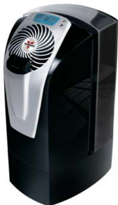
Whole Room Humidifiers