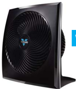
Whole Room Circulators