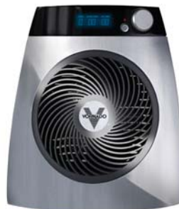
Whole Room Heaters